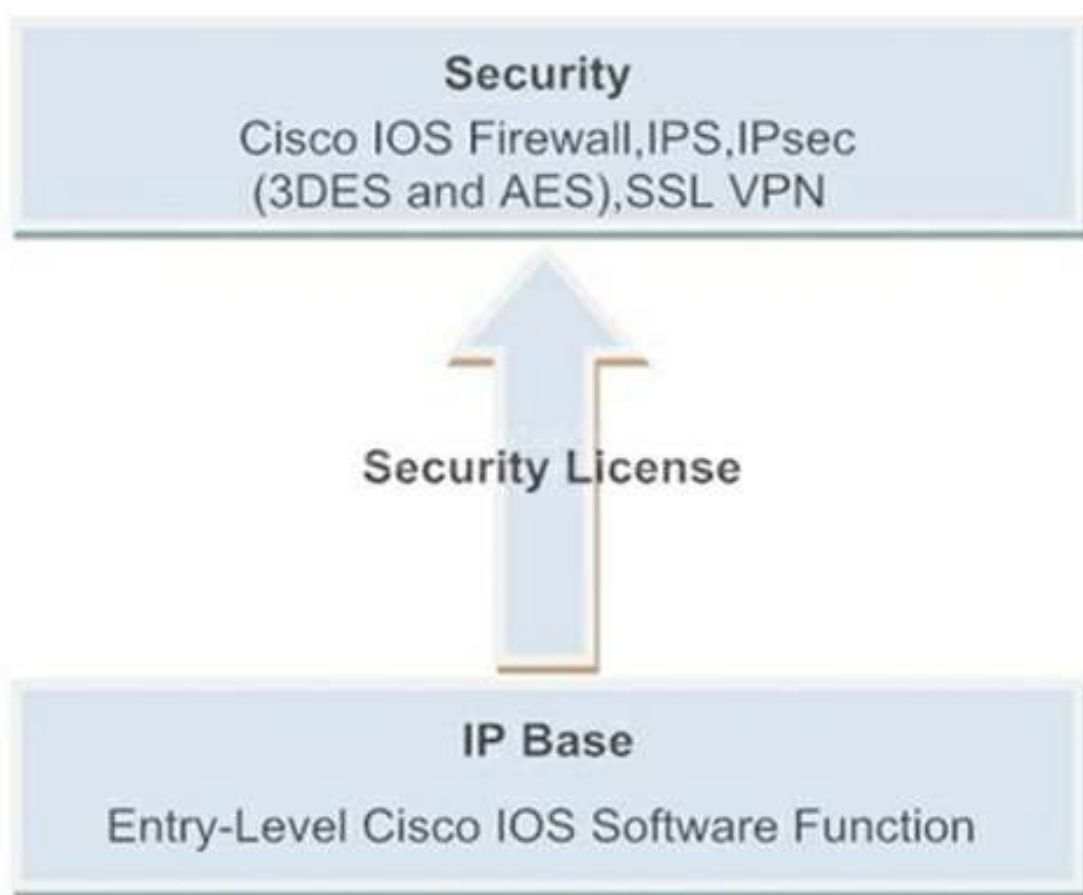
Figure 4 shows the Security Bundle Functions.