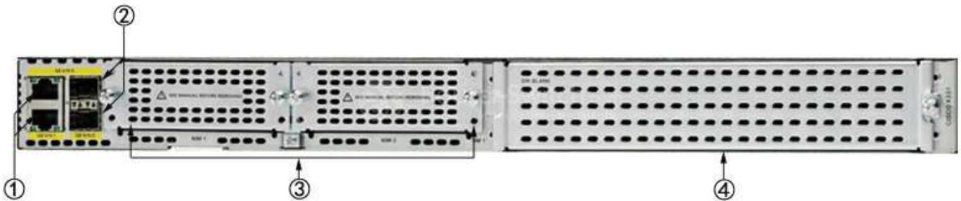
Figure 3 shows the back panel of Cisco ISR4331/K9for reference. ISR4331-V/K9 is similar with it..